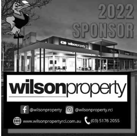
One of Warragul's Major Sponsors again in 2022.