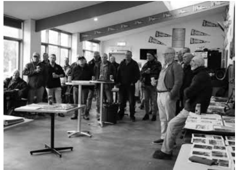
1976 LVFL Senior Premiership Reunion & Past Players Day