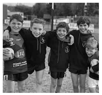
Young Gulls "Superstars" who just love their Footy.