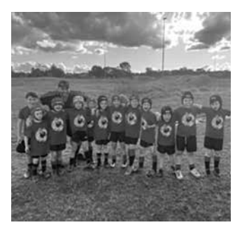
History in the making "First Ever U8s Team" The Smiles tell the Story!