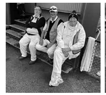
What would we do without Hagar, Rex & Waldo!