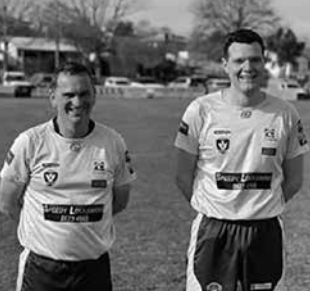
Two of the Finest Umpires going around. Top Fellas!