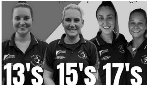
Gull's Junior Netball Coaches we thanks so much.