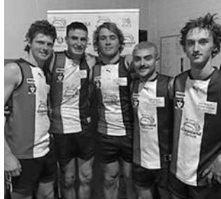
The "Fab 5" GL Interleague Stars