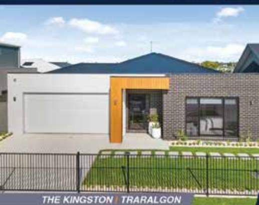
THE KINGSTON | TRARALGON