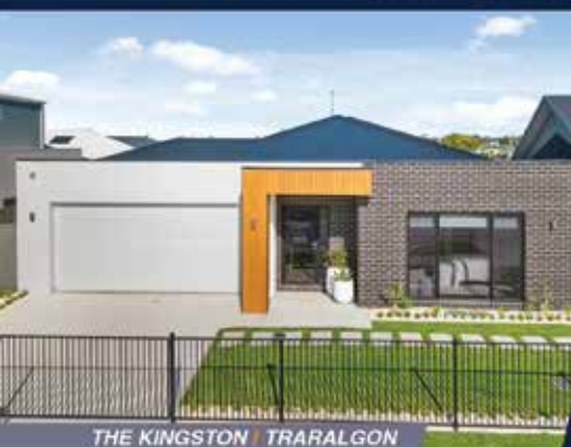
THE KINGSTON | TRARALGON