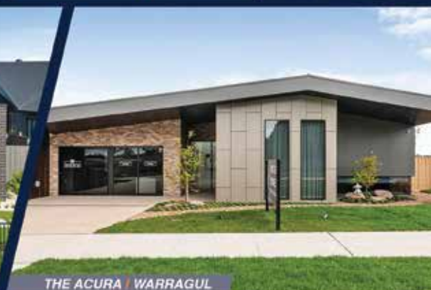
THE ACURA | WARRAGUL

VISIT VIRTUEHOMES.COM.AU CALL 03 5176 5997