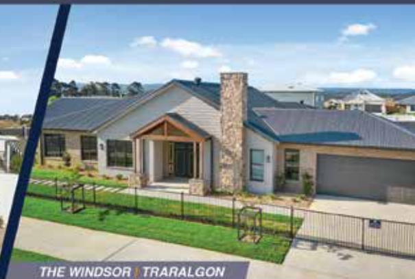
THE WINDSOR | TRARALGON