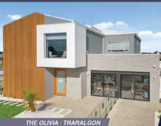
THE OLIVIA | TRARALGON